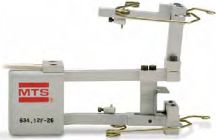
634.11F-24 (with extender)