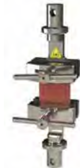
FSDS503A - Manual Vice