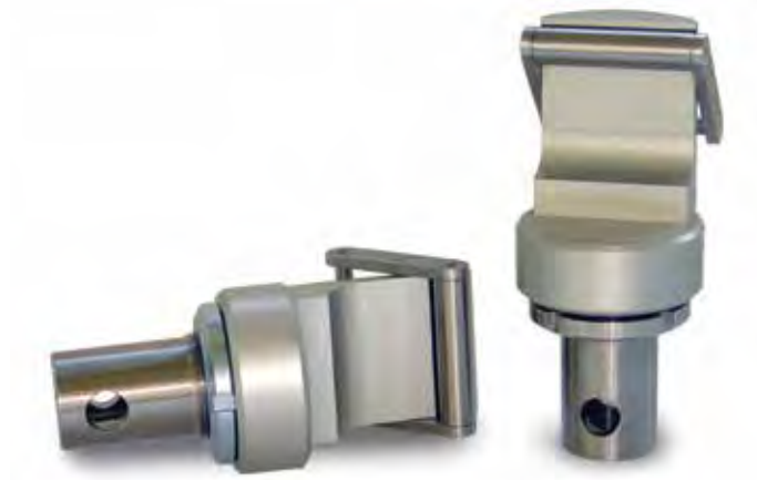
EnviroBath Optional Grip.06