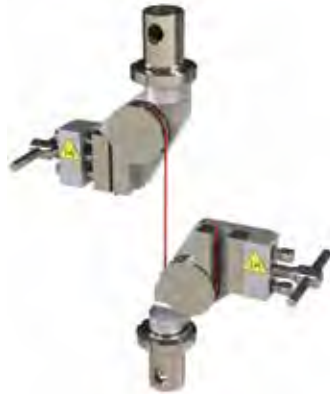
FCH203A – Manual Capstan