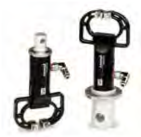
Advantage Pneumatic 10