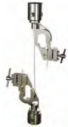
FCA104B – Manual Bollard