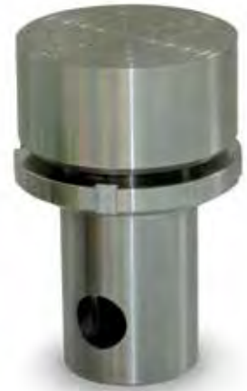
EnviroBath Optional Grip.02