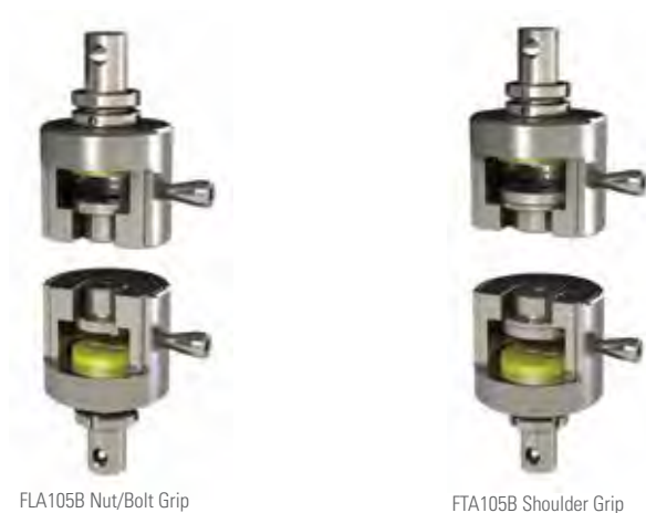
FLA105B Nut/Bolt Grip