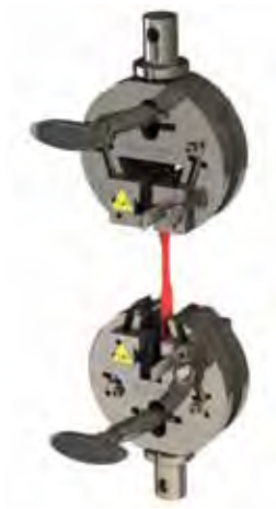
FXSC104B – Manual Wedge