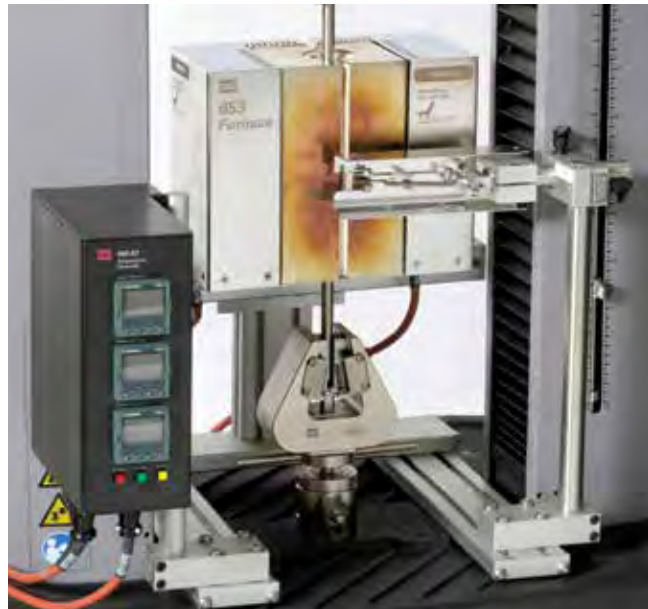
Model 653 Furnace