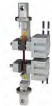
FDQA103B – Pneumatic Vice