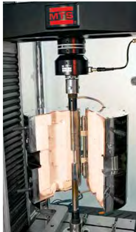
MTS Fundamental Furnace