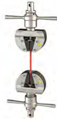
FXSA304A – Manual Wedge