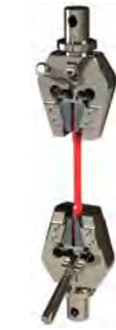
FXSA104B – Manual Wedge