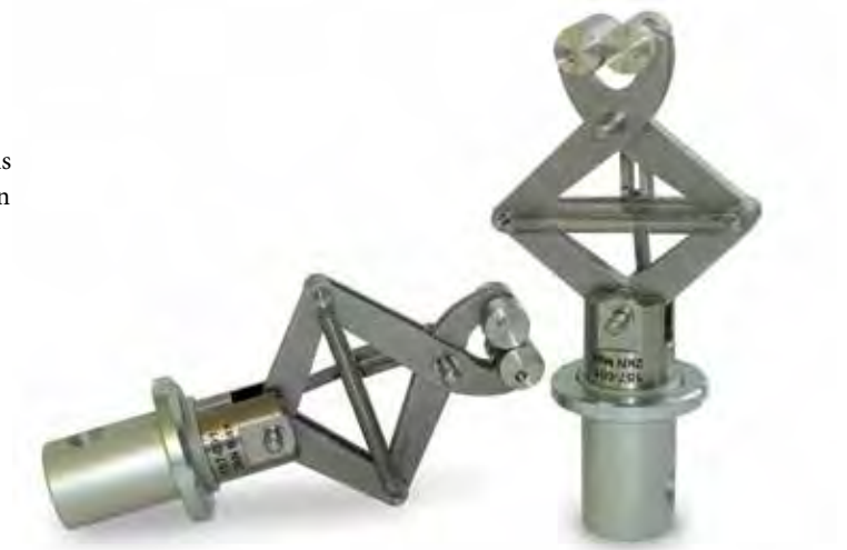
EnviroBath Optional Grip.08