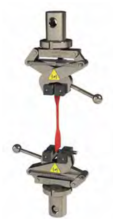
FGD203A - Manual Scissors