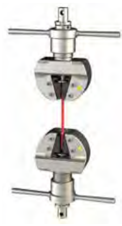
FXSA105A – Manual Wedge