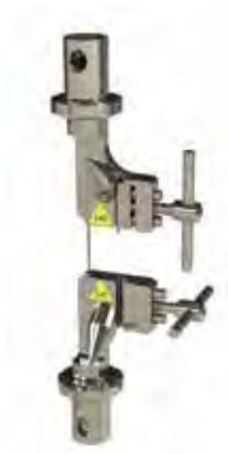
FCB502B – Manual Horn