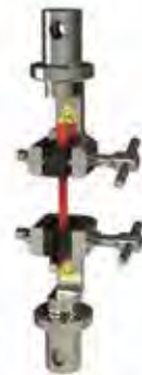
FDSA502B - Manual Vice