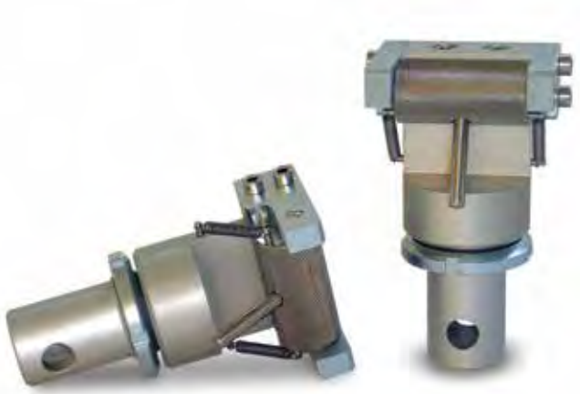
EnviroBath Optional Grip.05