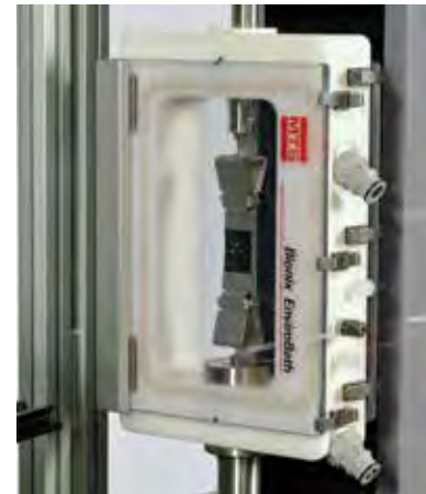
Bionix EnviroBath 1