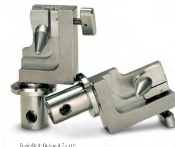
EnviroBath Optional Grip.01