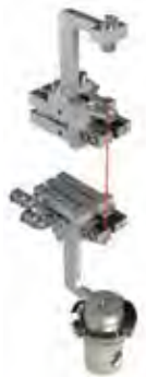
FDQA101B– Pneumatic Vice