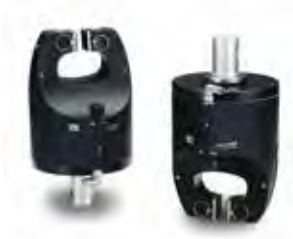
Advantage Pneumatic 2000