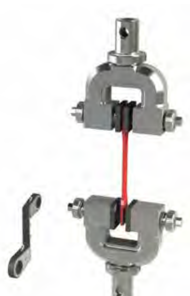
FDSB503B - Manual Screw (stainless steel)