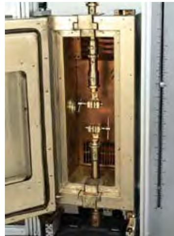
MTS Fundamental Environmental Chambers