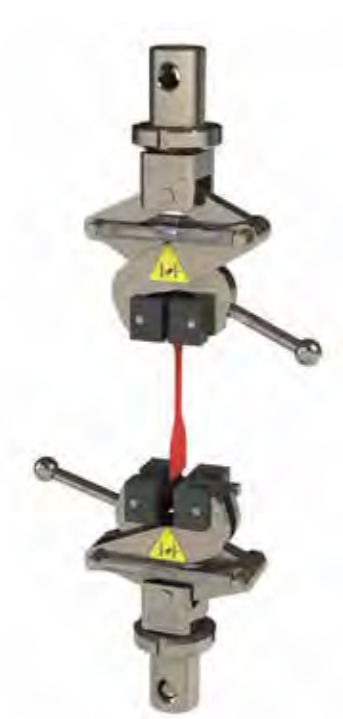
FGD503A - Manual Scissors