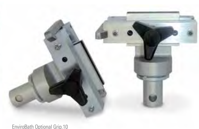
EnviroBath Optional Grip.10