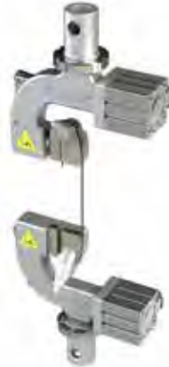
FCQA502A – Pneumatic Horn