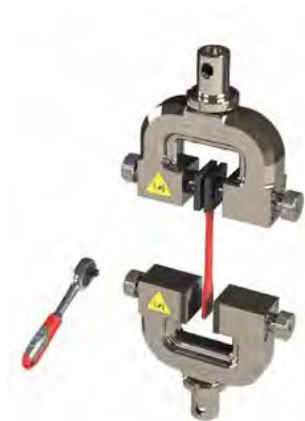
FDSC503B - Manual Screw