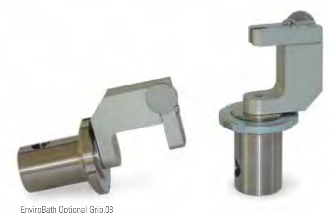
EnviroBath Optional Grip.08