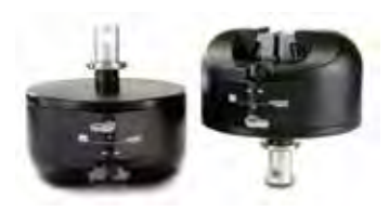
Advantage Pneumatic 10,000