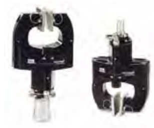
Advantage Pneumatic 100/200